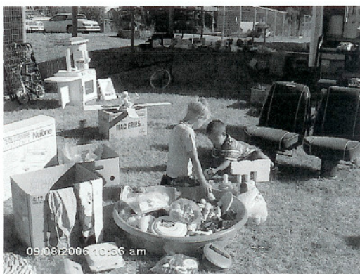
Toy Run at Alberni