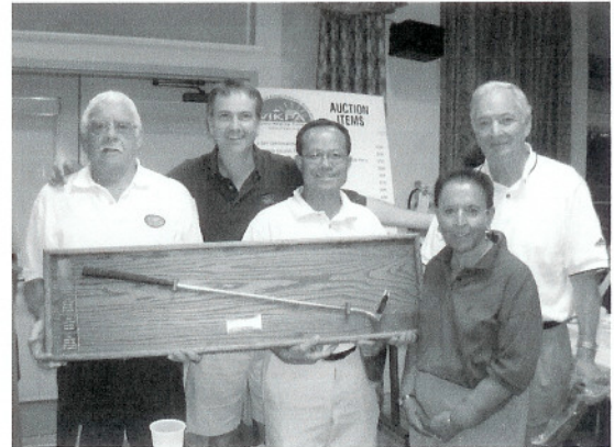
The winning golf team