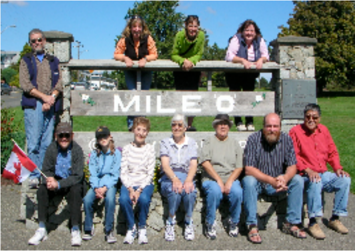
Renal patients and staff gather at Mile 0 to kick off the Home Dialysis Program Walk Across Canada Challenge.

Walking is currently the most popular physical activity for adults in Canada. It can be done anytime, anywhere, is free and has benefits to health and well being. Nephrologists and staff from the Home Dialysis Program (which includes people doing peritoneal dialysis and home hemodialysis) are trying to encourage increased activity for people doing home based dialysis.